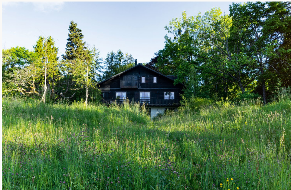
Erik Dhont's landscaped garden for gallerist Karin Handlbauer is designed to complement a renovated 1920s chalet (left) and features a Vals stone swimming pool (below) and an unstructured, undulating terrain (bottom)